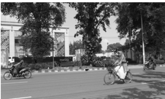
Women riding bicycles on roads are vulnerable to fast moving vehicles.

Despite the relative ease of bicycle use for women a number of barriers discourage their use, these range from cultural concerns about beauty, practical concerns about safety, as well as lack of supporting infrastructure and restrictive