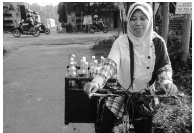
Many women use bicycles to sell jamu, a traditional medicine

There are a range of different reasons and uses why women use bicycles today. They vary between social classes. Bicycle use by women for commuting is declining, but its use for recreation is rising.