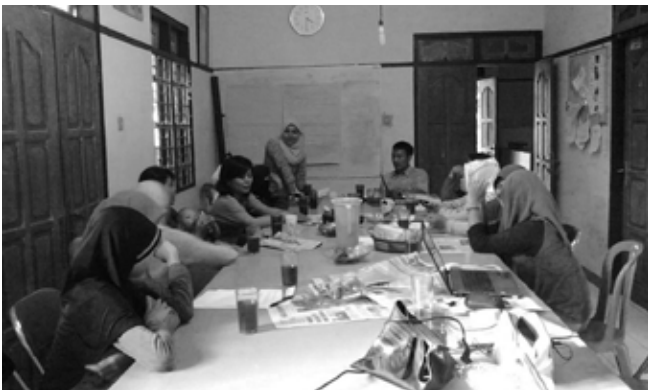
Kota Kita facilitates a focus group discussion with women bicyclists in Solo

The research took place over a two-month period between February and March 2015. The methodology was varied – we conducted desk-based research, focus group discussions, individual interviews, and observations in the field.