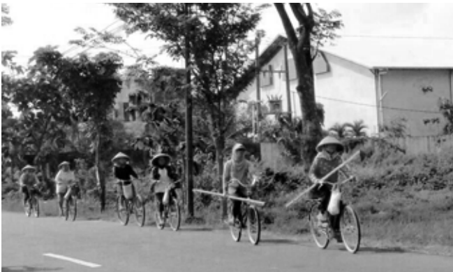
Female agricultural laborers commute to their jobs around the periphery of Solo from nearby villages

Bicycling is not a new phenomenon in Indonesia, it has been around since the Dutch colonial era and has been a popular form of transportation for generations: