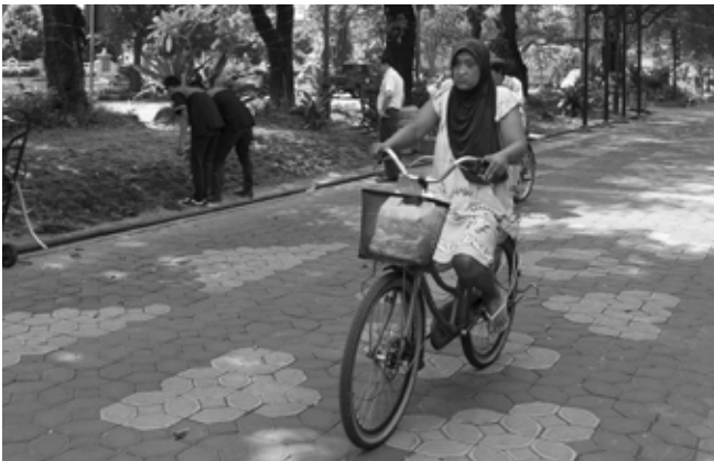
Bicycles offer a flexible way of shopping locally at many of Solo's traditional markets

Given the variety of transportation options available to women, why do they choose to ride bicycles?